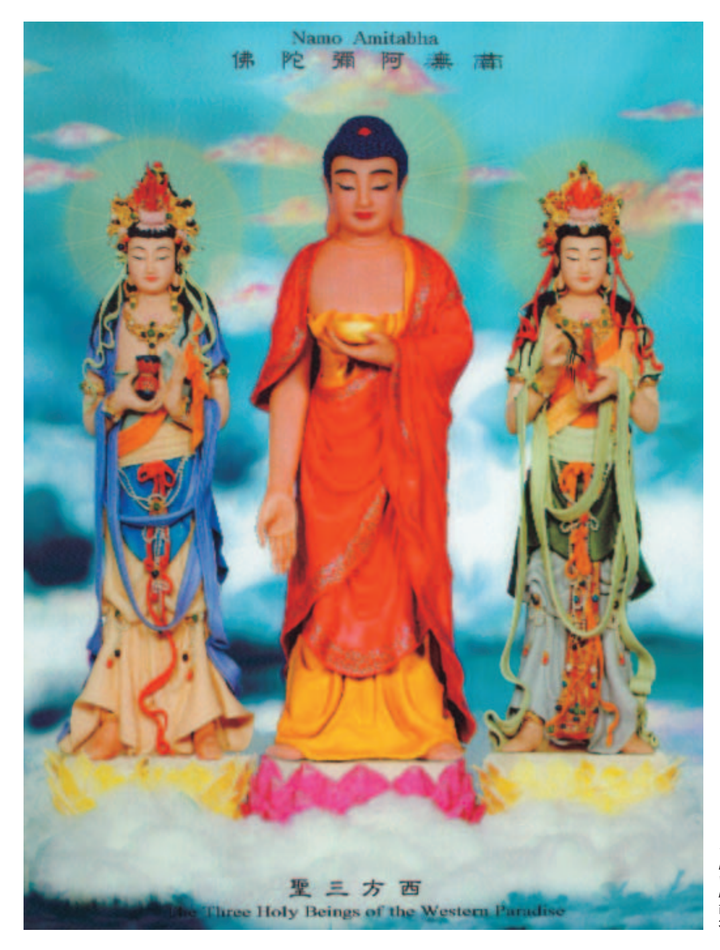
The original "Three Holy Beings of the Western Paradise" is three-dimensional. 西方三聖原件作品為 3D立體