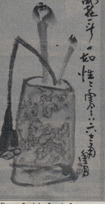
"Two Flowers; One Lotus Capsule, One Dharma Nature"

US$300,000 per square foot. Another painting, "Plum Blossoms", was sold at US$210,000 per square foot. However, the most anticipated painting, "Pasture in Spring (a shepherd boy herding cattle)", was not sold at this time. "Pasture in Spring" was considered the most valuable of the three donated paintings. Even though the buyer raised the price to US$540,000 per square foot, the seller insisted that the price cannot be below US$900,000 per square foot. Therefore, this transaction was not completed because of the great difference between the prices.