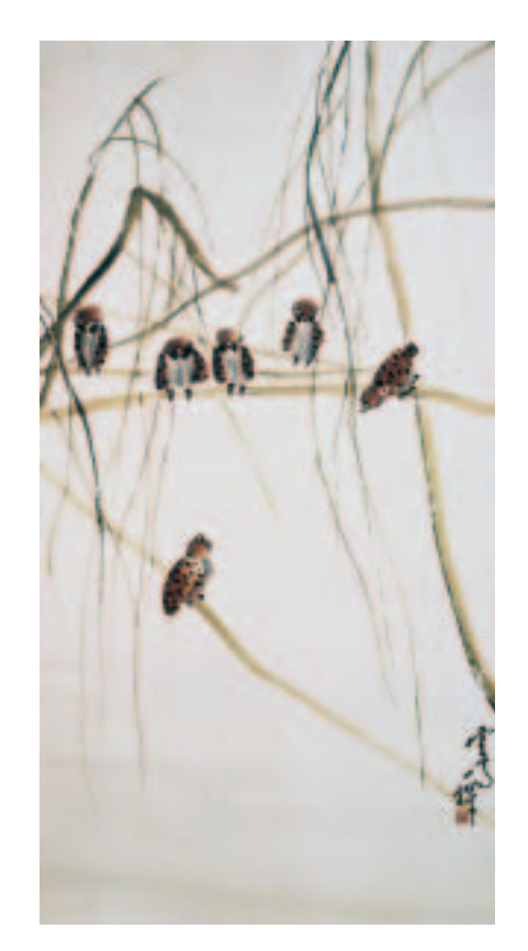
A Flock of Twittering Sparrows in Early Spring 宿士鬧春

Flowers and Birds in Freehand Brushwork 寫意花鳥