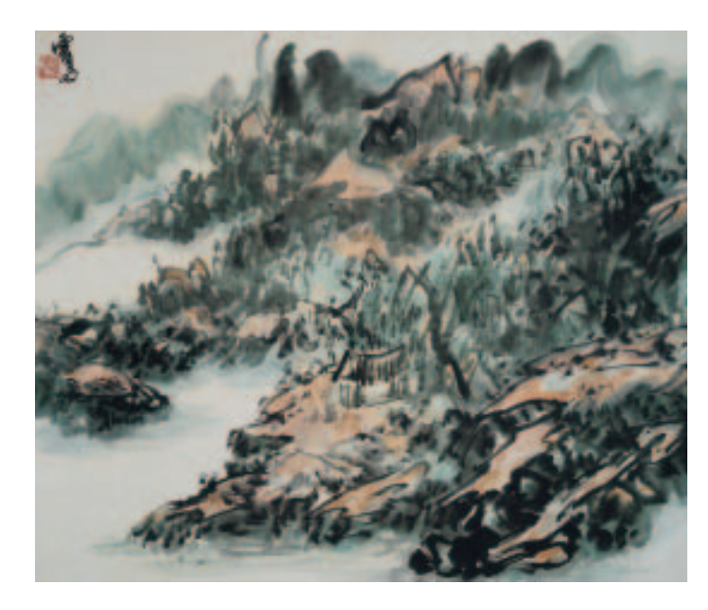
Rich, Lustrous, Thick Ink Displays Profound Learning 渾厚華滋書卷濃