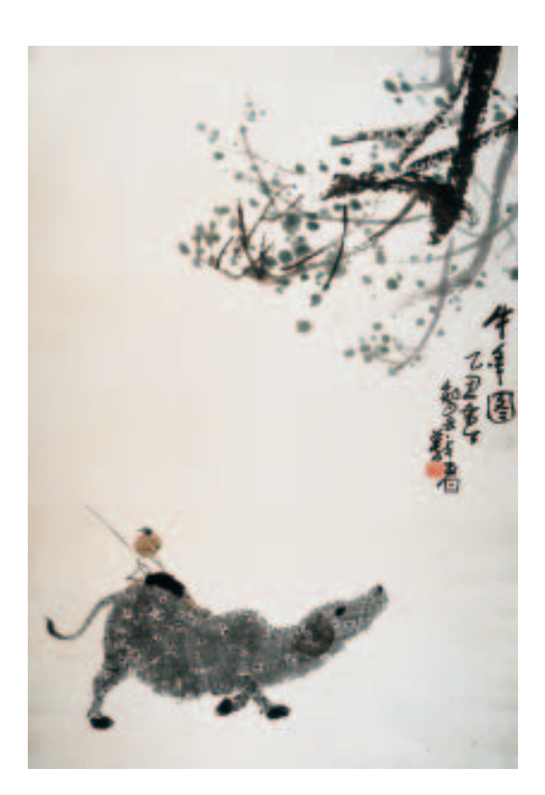
Herd-boy's Poem and Song 牧牛歌兮

Flowers and Birds in Freehand Brushwork 寫意花鳥